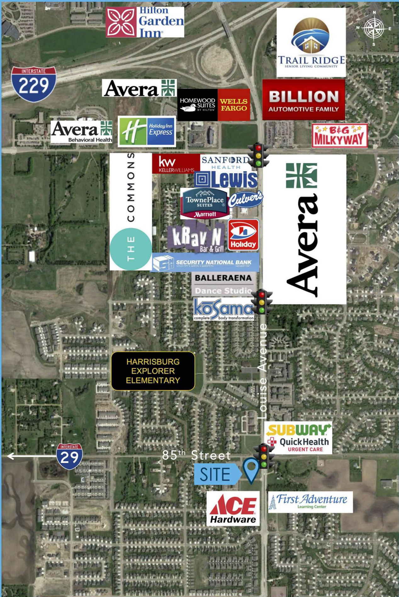
Louise Avenue Map