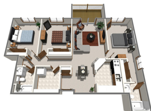
3 BD 2 BA | 1388 SF