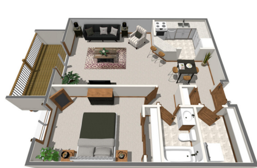
1 BD 1 BA | 812 SF