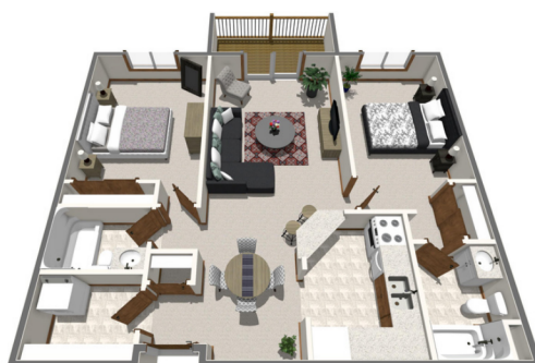
2 BD 2 BA | 1025 SF