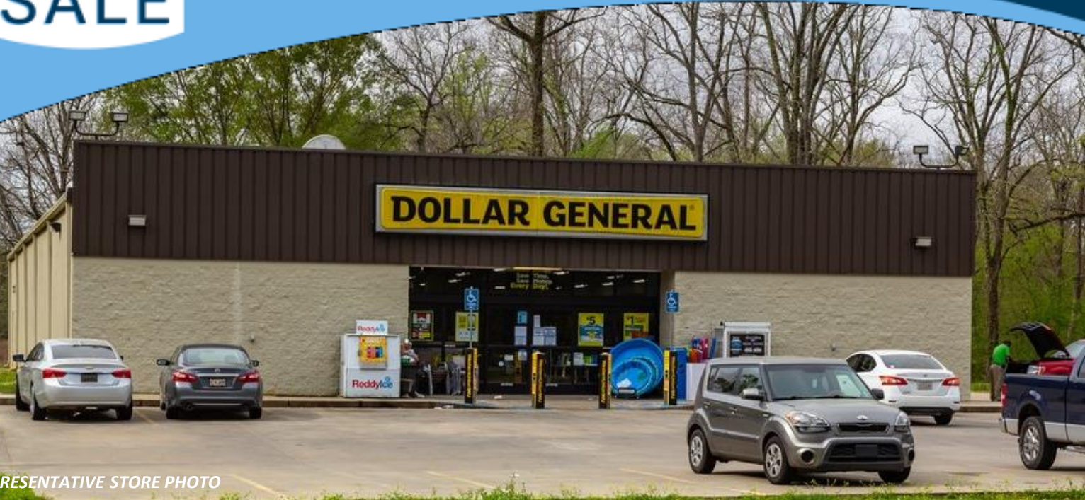
REPRESENTATIVE STORE PHOTO